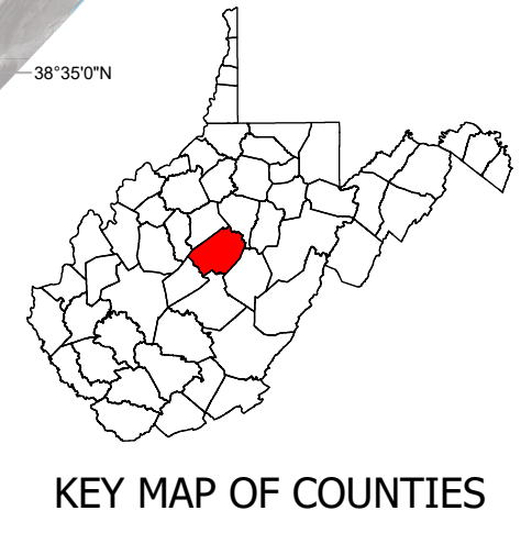
KEY MAP OF COUNTIES